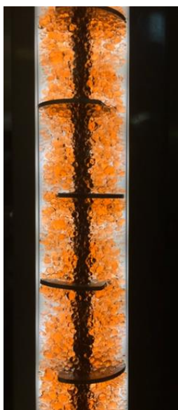
Pulsed extraction column, 5 cm diameter..

Consequently, the most common approach among recyclers ( MTB , Paprec , Véolia ), before any chemical treatment, is the grinding at the scale of the device or its modules, followed by steps of separation of the particles by physical methods using the differences in densities or magnetic properties. Depending on the purity of the powders obtained, thermal or chemical treatments are then used to refine the composition of the final products.