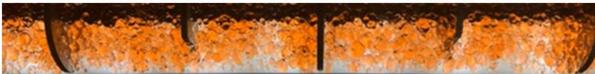
Pulsed extraction column (normally positioned vertically).